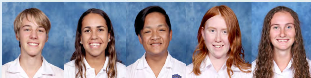
Wauchope High School Leaders 2019