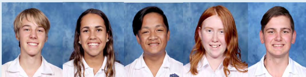
Wauchope High School Leaders 2019