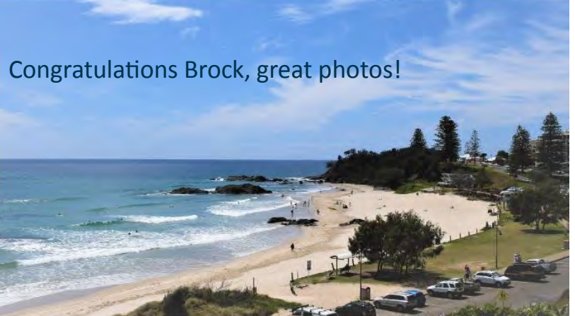
Congratulations Brock, great photos!