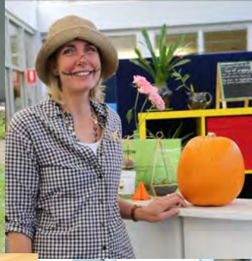
Year 11 Halloween fundraiser