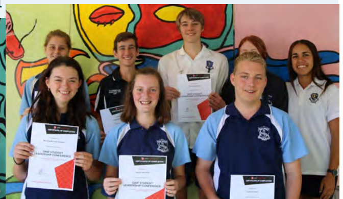
Leadership conference attendees