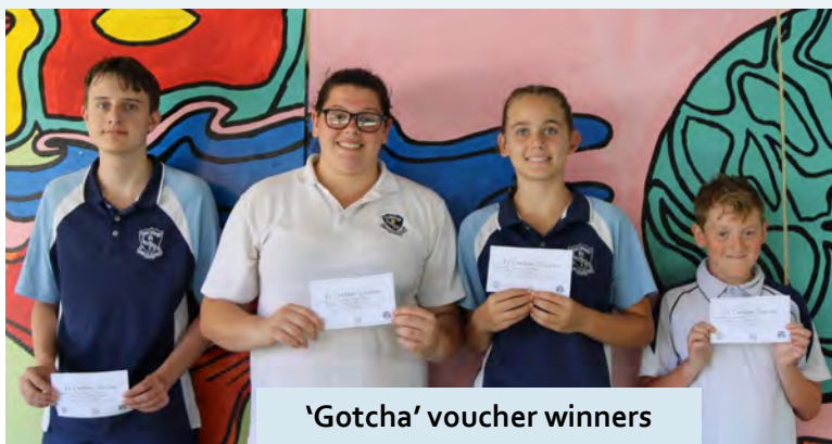
'Gotcha' voucher winners

Every Monday on assembly a different faculty will be presenting their Faculty Excellence Awards. Students will be chosen for being consistently engaged and achieving academically within that