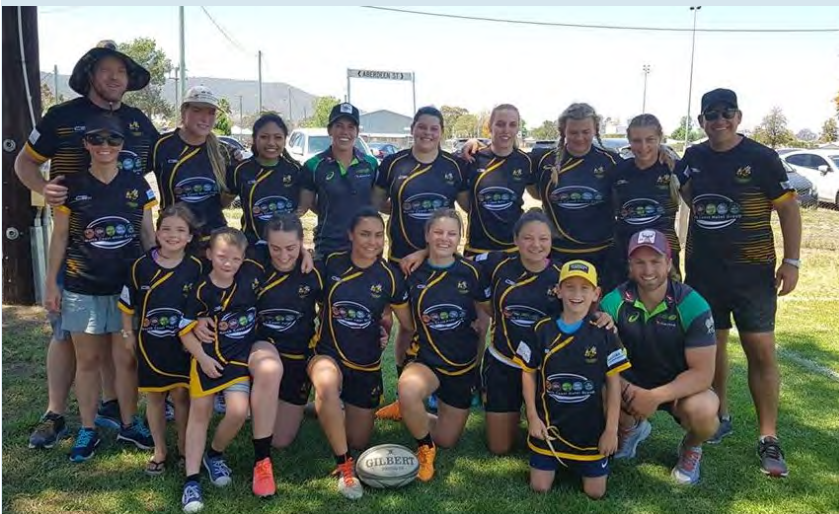
Stingers and Charlotte Caslick

the best female rugby player in the world, Charlotte Caslick. MT's favourite rugby player apart from all the Wauchope girls.