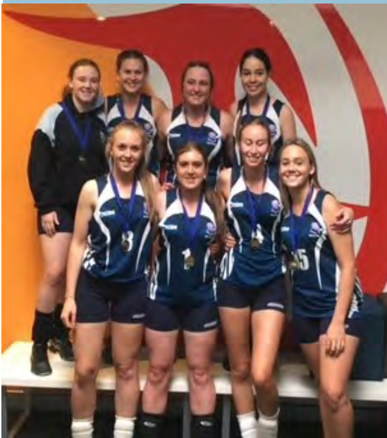
Open Girls Volleyball team who won the recent school's cup competition