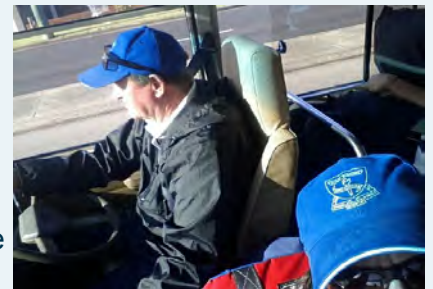
Our teachers sporting their Wauchope High School hats.