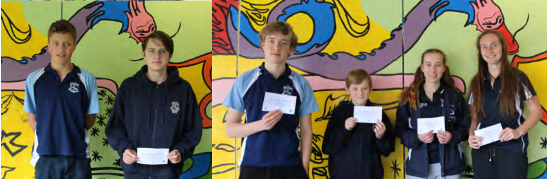
Gotcha prize recipients

Every Monday on assembly a different faculty will be presenting their Faculty Excellence Awards. Students will be chosen for being consistently engaged and achieving academically within that subject area.