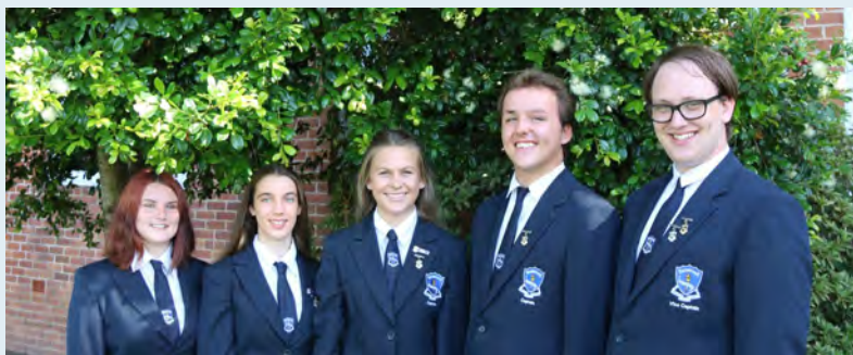
Wauchope High School Leaders 2018