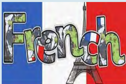
Table etiquette was the focus of French lessons last week. Year 7 students were given the challenge of setting a formal table with three sets of knives, forks and spoons. There were some interesting combinations and discussions about the need for so much cutlery. Most parents would be happy if their children used just one knife and fork!