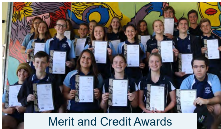
Merit and Credit Awards

Congratulations to the students who entered the Australian History Competition