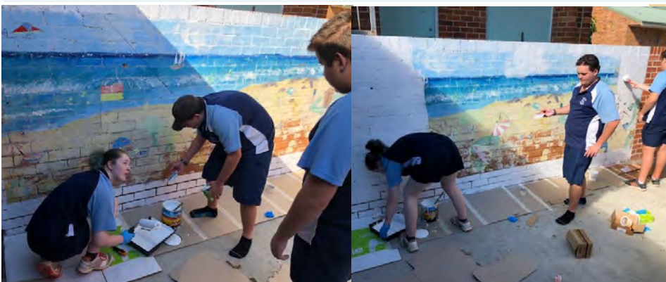
Year 10 marine studies students preparing the wall for the aquaponics hanging garden.