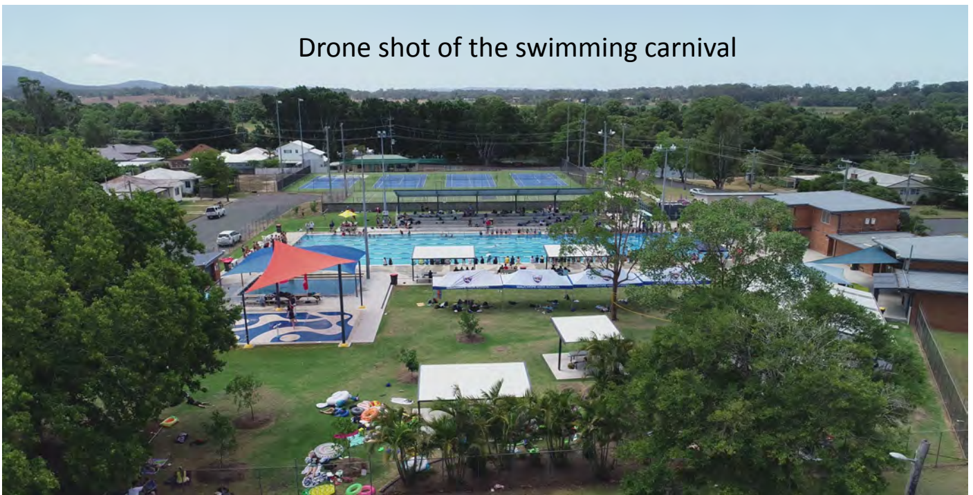
Drone shot of the swimming carnival