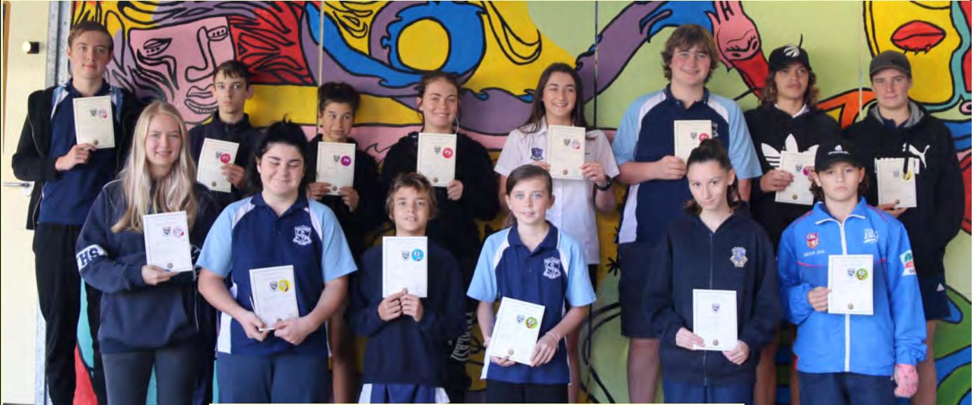
TAS Faculty Award Recipients

Every Monday on assembly a different faculty will be presenting their Faculty Excellence Awards. Students will be chosen for being consistently engaged and achieving academically within that subject area.