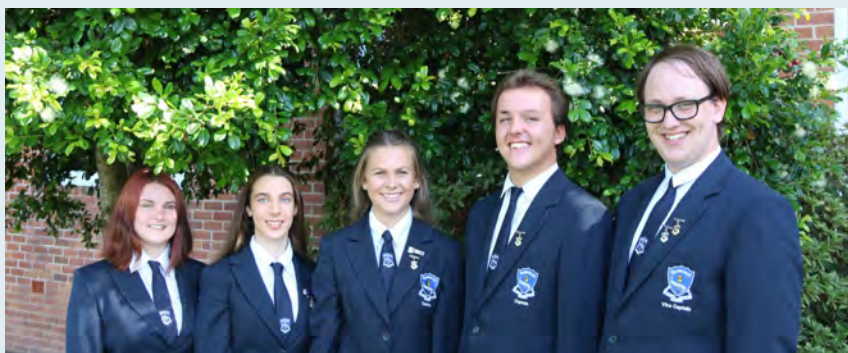
Wauchope High School Leaders 2018