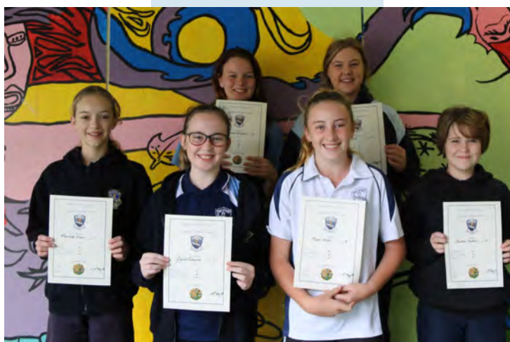
Executive staff cross faculty awards

Science students this week showing keen interest in the workings of a pluck