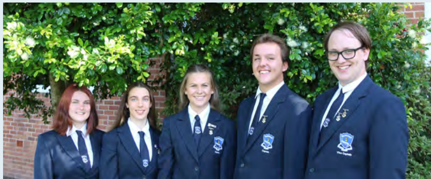
Wauchope High School Leaders 2018