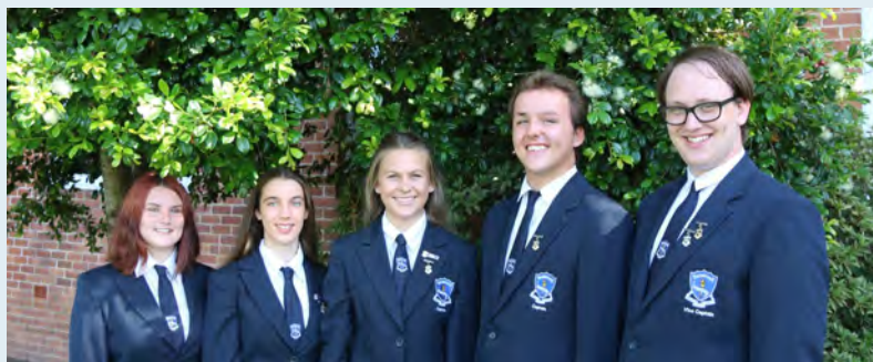
Wauchope High School Leaders 2018