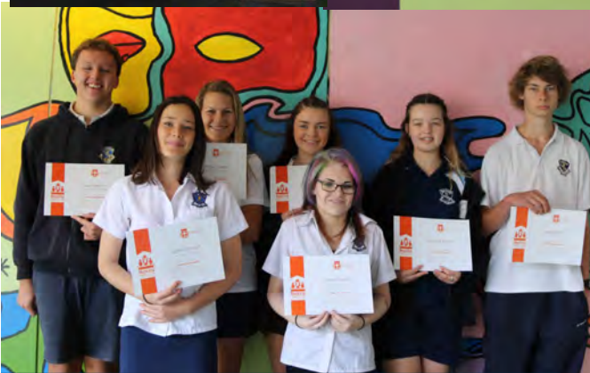
Mock Trial team