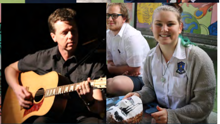
Talented students and teachers, aren't we lucky!!!

Basketball Junior Gala Day where both teams made the finals