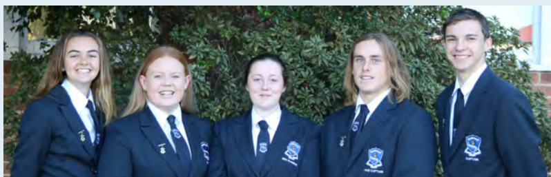
Wauchope High School Leaders 2017

School Captain speeches were presented last Monday to the school assembly. 2018 Captains will be announced at the Year 12 Final Assembly Friday 22nd September.