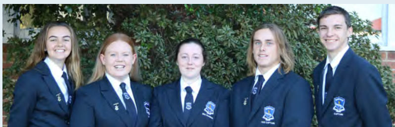
Wauchope High School Leaders 2017