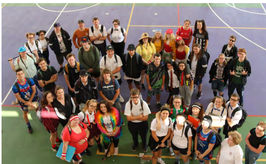
Year 12 having a bit of fun on their last days as students at Wauchope High School