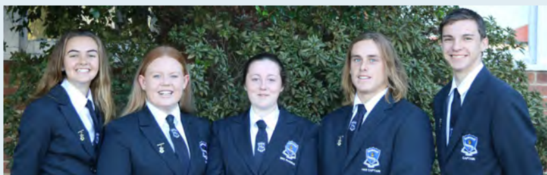
Wauchope High School Leaders 2017