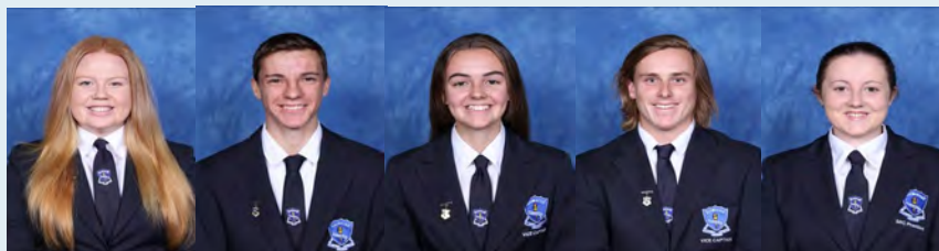
Wauchope High School Leaders 2017