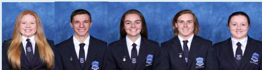
Wauchope High School Leaders 2017