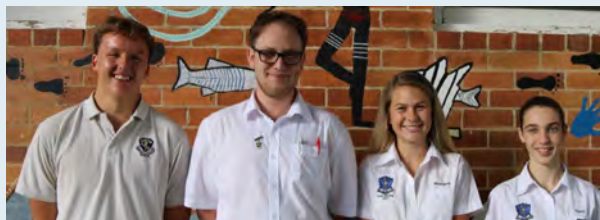
Wauchope High School Captains 2018