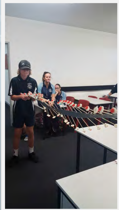
Lolly wave machine

Having fun in Science lessons studying waves and light.