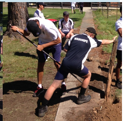
Year 12 and Year 11 Primary Industries students dismantling the old wooden fence