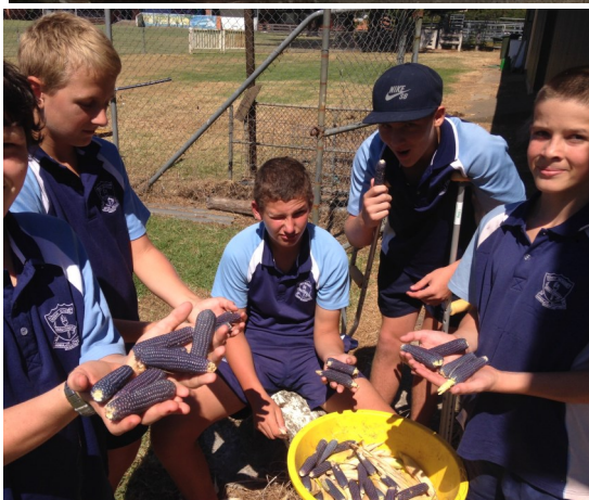
Year 8 Agriculture harvesting blue popping corn