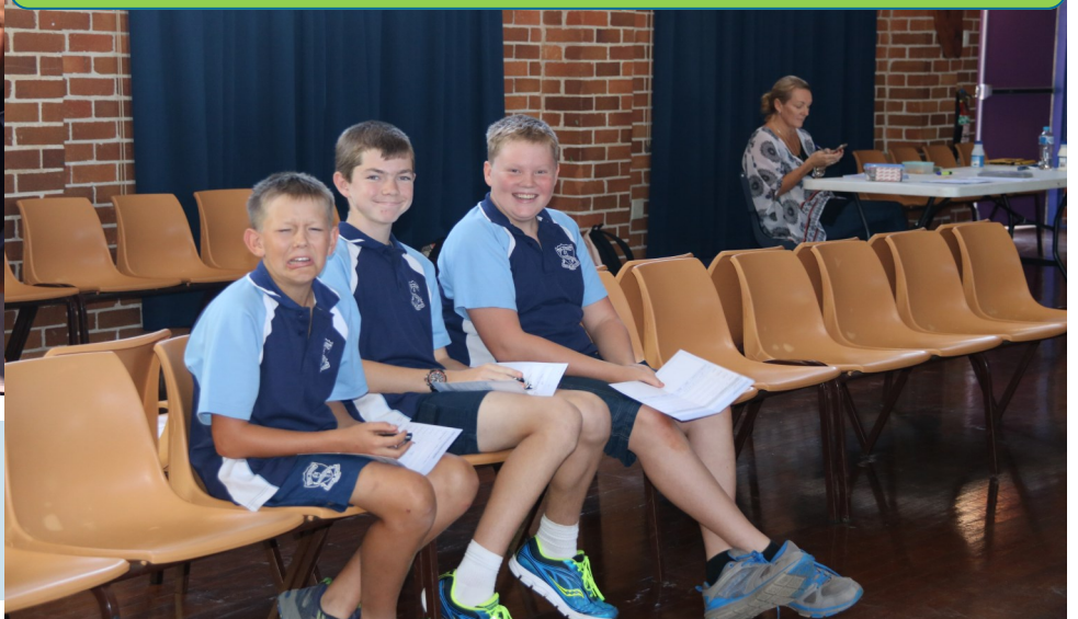
Year 7 Immunisations Smiles all round...well almost!!