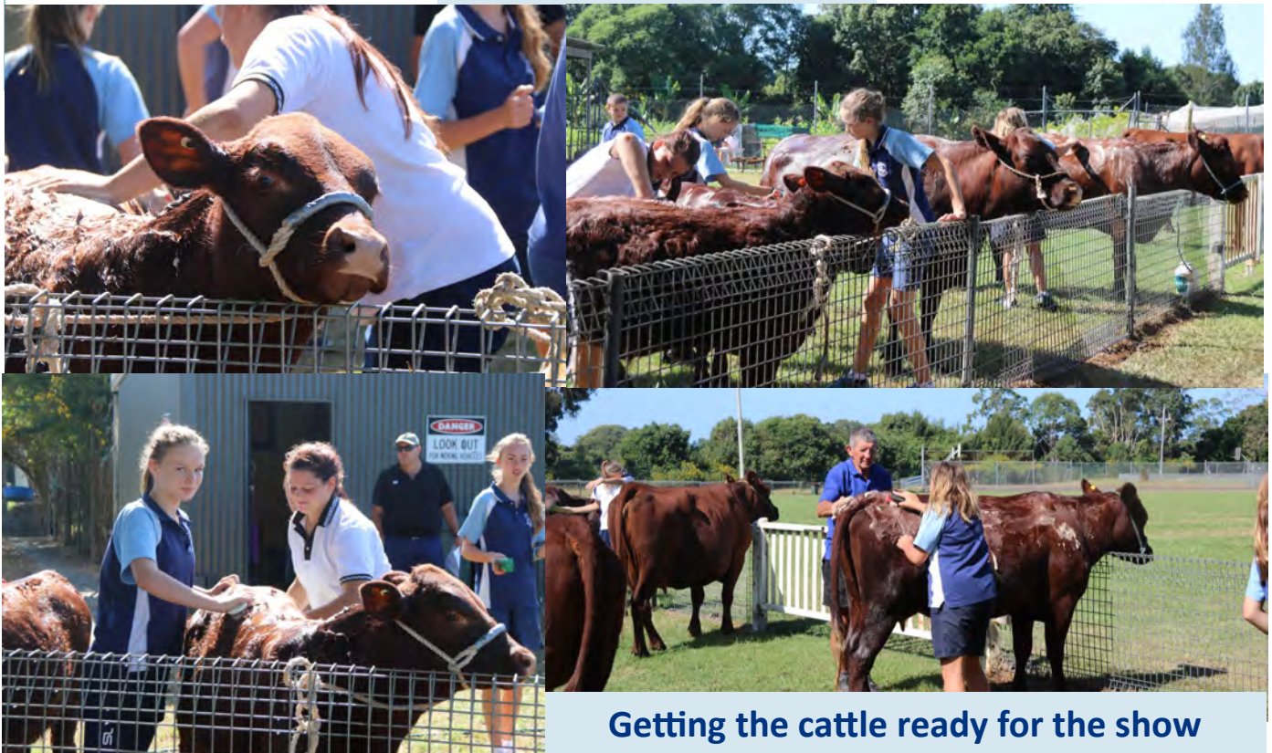
Getting the cattle ready for the show