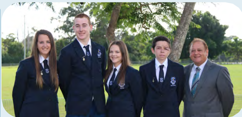
Wauchope School Leaders 2016