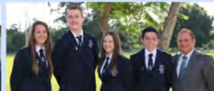
Wauchope High School Leaders