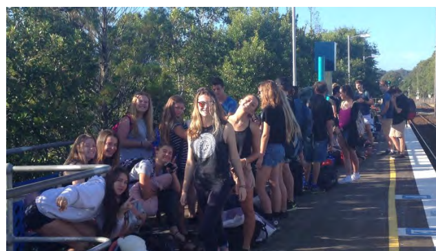
Senior students on their way to Sydney for the HSIE excursion