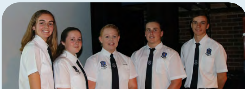
Wauchope School Leaders 2017

See inside for Equipment Requirements for 2017