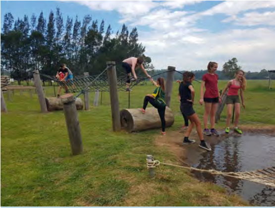
More fun at the Year 8 Camp