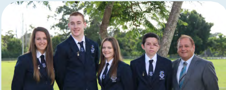
Wauchope School Leaders 2016

website: http://www.wauchope-h.schools.nsw.edu.au Phone: 65 851400